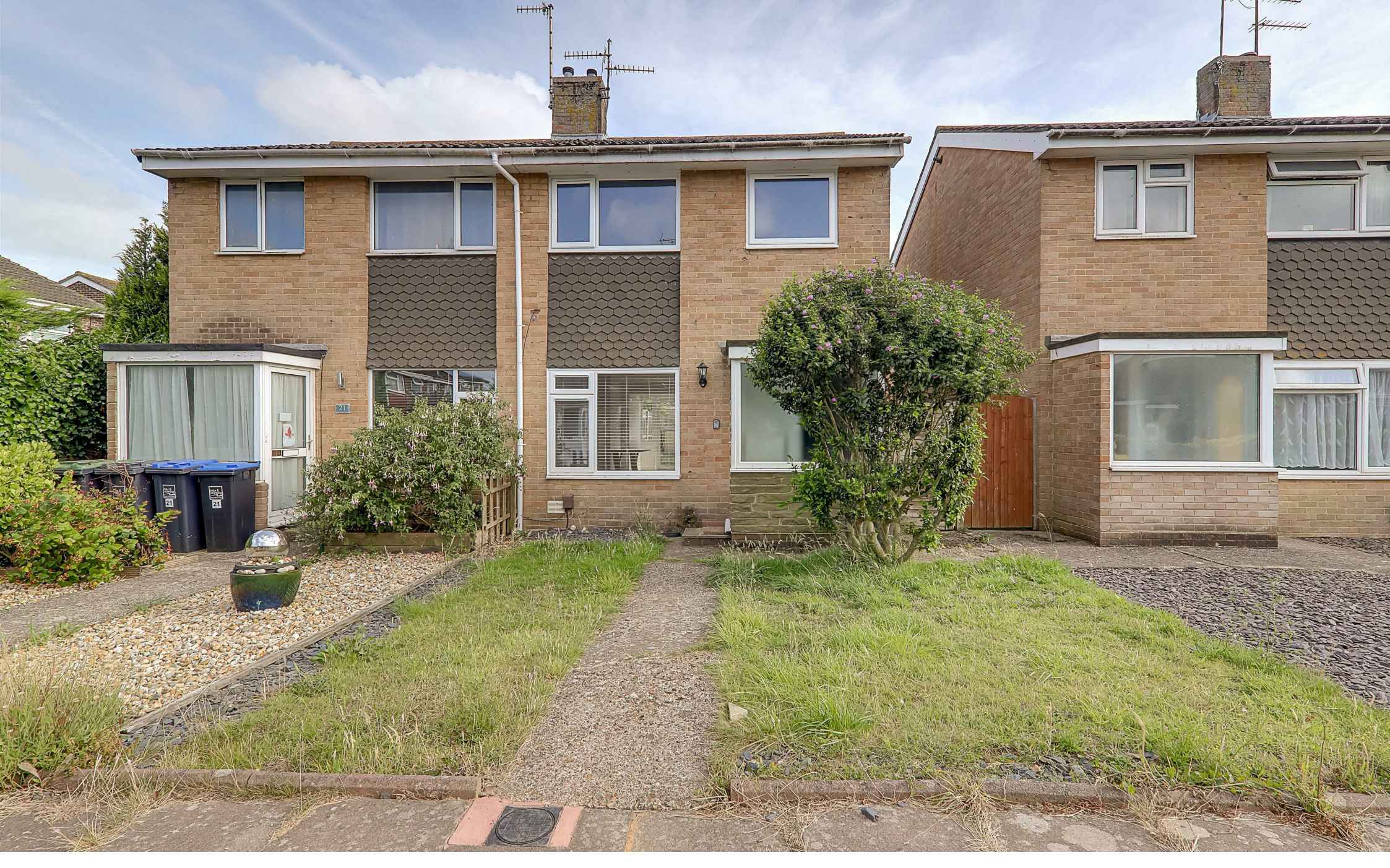
22 Chilgrove Close, Worthing, BN12 6NQ Price £350,000